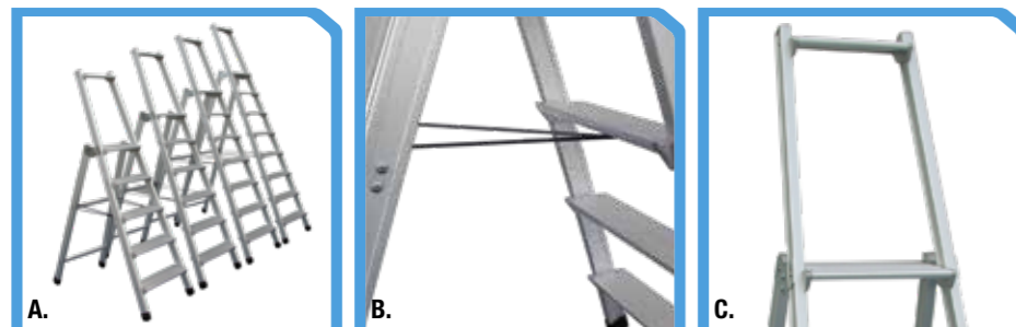
A. Different heights B. Anti-opening tape C. Guard rail

This model can also be supplied with handrail.